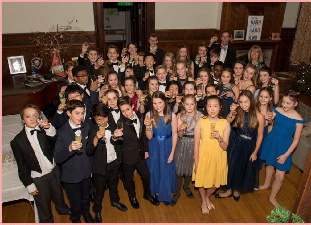
The Ball was followed by the Rainbow-themed Borders' disco